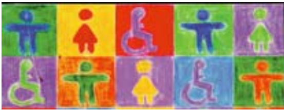
Drawing by Marina Wirlitsch, European Year of People with Disabilities 2003

People with disabilities should receive equal treatment at work. This includes equality regarding health and safety at work. Health and safety should not be used as an excuse for not employing or not continuing to employ disabled people. In addition, a workplace that is accessible and safe for people with disabilities is also safer and more accessible for all employees, clients and visitors. People with disabilities are covered by both European anti-discrimination legislation and occupational health and safety legislation. This legislation, which the Member States implement in national legislation and arrangements, should be applied to facilitate the employment of people with disabilities, not to exclude them.