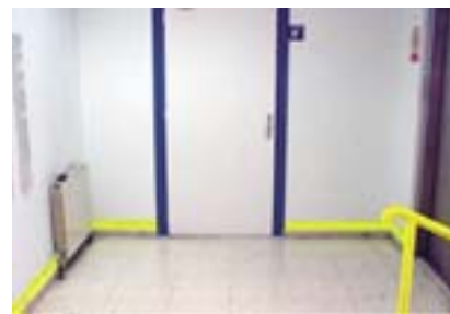
Colour contrast helps mobility

European Agency for Safety and Health at Work Gran Vía, 33, E-48009 Bilbao Tel. (34) 944 79 43 60, fax (34) 944 79 43 83 E-mail: information@osha.eu.int